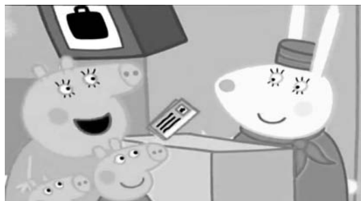
(2) [ ]