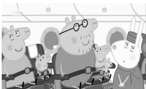
(5) [ ]