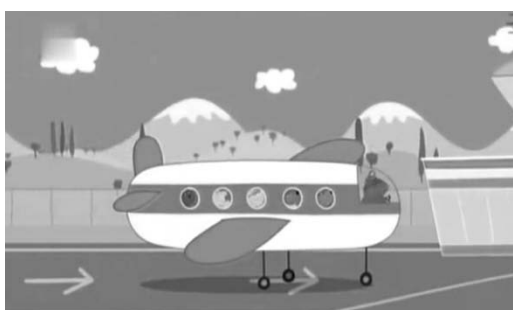
(6) [ ]