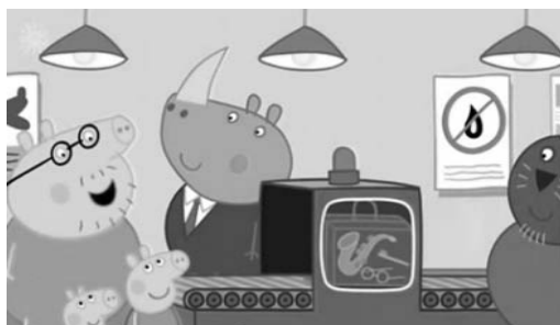
(3) [ ]