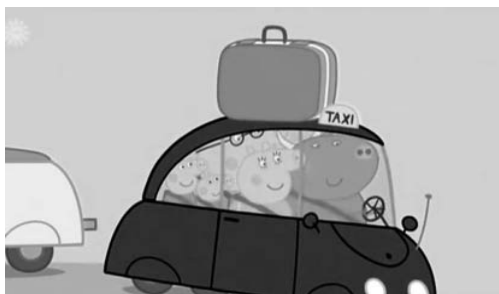
(1) [ ]

Listen to the following sentences and match them with the pictures below.